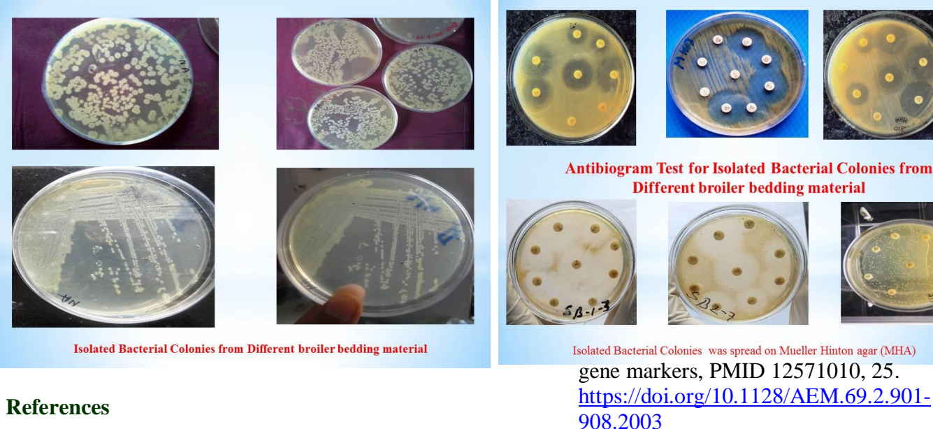
Fig.2 Plate showing single isolated colony & ABST Test against bacterial colony